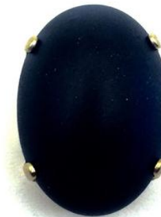
Embroidery stone oval shape available in different sizes - Art. 9047