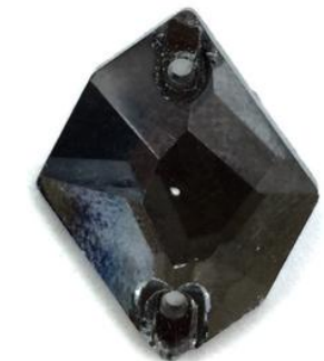
Sequin stone in irregular shape with 2 holes - Art. BN3265