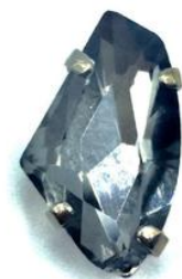
Embroidery stone irregular shape, 19x11,5 mm - Art. BN4757