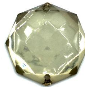
Stone to sew octagonal shaped matt beige - Art. 7215