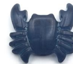
Sea theme accessory, crab shaped, 2 cm - Art. 7220