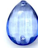
Trimming crystal tear shape, 1 cm - Art. 6855