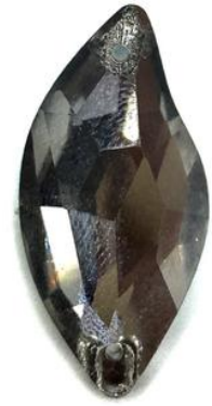
Sequin stone with 2 holes, irregular shape - Art. BN3254