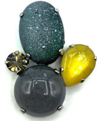
Stones application to sew - Art. 9083