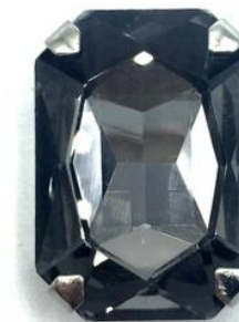
Embroidery stone rectangular shape with cropped corners - Art. BN4627