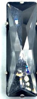
Stone baguette to sew - Art. BN4547