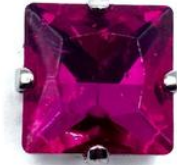
Square stone to sew on clothes - Art. BN4447