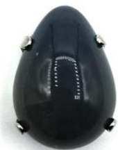
Embroidery stone in tear shape - Art. 9081