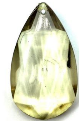
Stone to sew tear shaped in polyester, 4 cm - Art. 6860