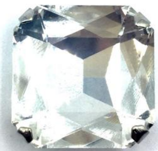
Embroidery stone with cropped corners - Art. BN4675