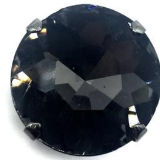
Embroidery stone round shape - Art. BN1201