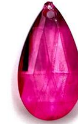
Polyester stone to sew tear shaped in magenta color, 2,5 cm - Art. 6855