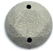
Glitters stone round shaped to sew, golden color - Art. 7192