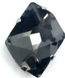
Precious embroidery stone irregular shape - Art. BN4739