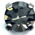
Embroidery rhinestone with brass setting - Art. BN 1100