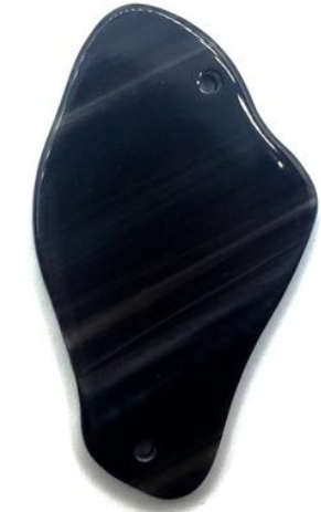
Stone to sew in wood effect with 2 holes - Art. 7252