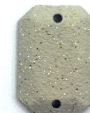
Glitters stone in golden color, octagonal shaped to sew - Art. 7191