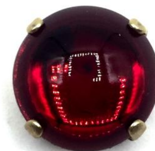
Embroidery stone with shiny cabochon full effect - Art. 9048