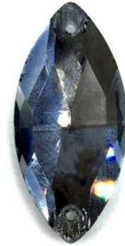
Embroidery stone in almond shape with 2 holes - Art. BN3223