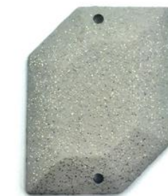
Glitters stone in irregular shape - Art. 7190