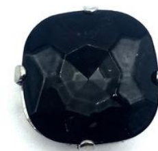
Embroidery stone with rounded corners - Art. BN4470