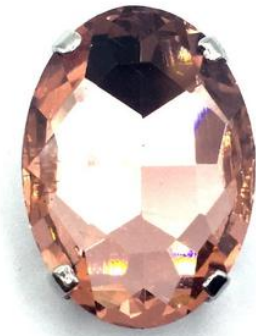
Oval shape stone to sew on clothes - Art. BN4120