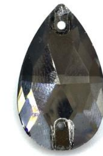
Embroidery stone with 2 holes, tear shape - Art. BN3230