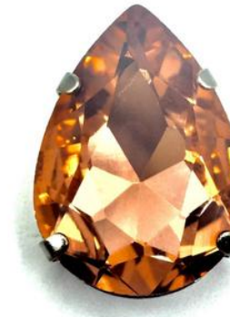
Embroidery stone in drop shape - Art. BN4320