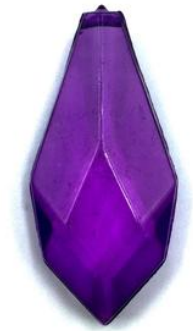
Polyester stone to sew geometric shape, 4 cm - Art. 6859