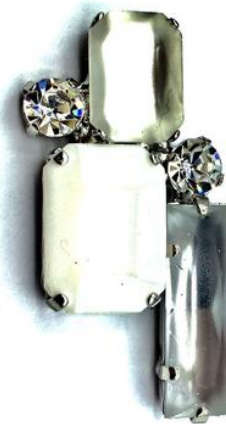
Rhinestones application with matt effect - Art. 9084