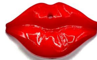
Polyester application to sew, red lips shaped, 3,5 cm - Art. 7172