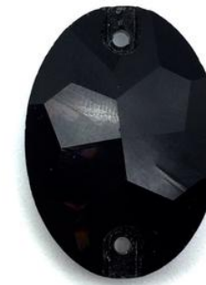
Embroidery stone with 2 holes, oval shape - Art. BN3210