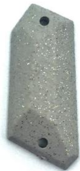
Stone to sew irregular effect with golden glitters, 2.5 cm - Art. 7193