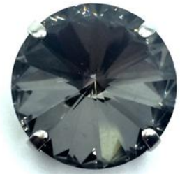
Embroidery stone round shape - Art. BN1122