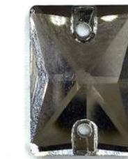
Embroidery stone rectangular shape, with 2 holes - Art. BN3250